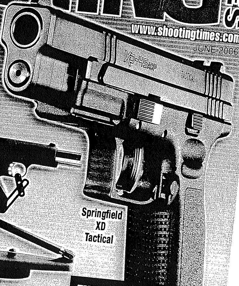
Springfield XD Tactical