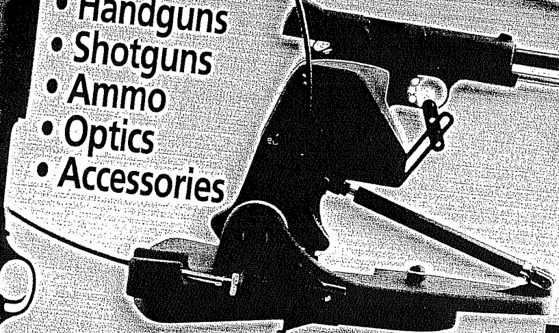
Caldwell HAMMR Machine Rest