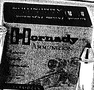
Hornady .500 S&W Evolutionary